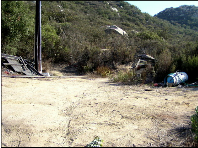
Photograph 1: View toward Margarita SDSU candidate location, facing southwest.