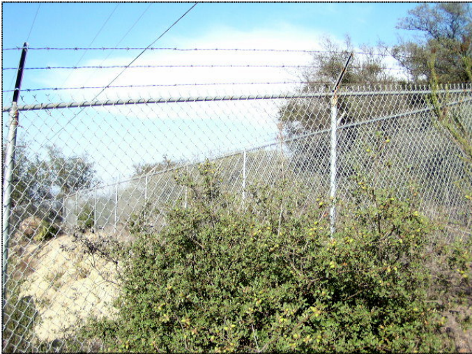
Photograph 7: View from Margarita SDSU candidate location, facing east.