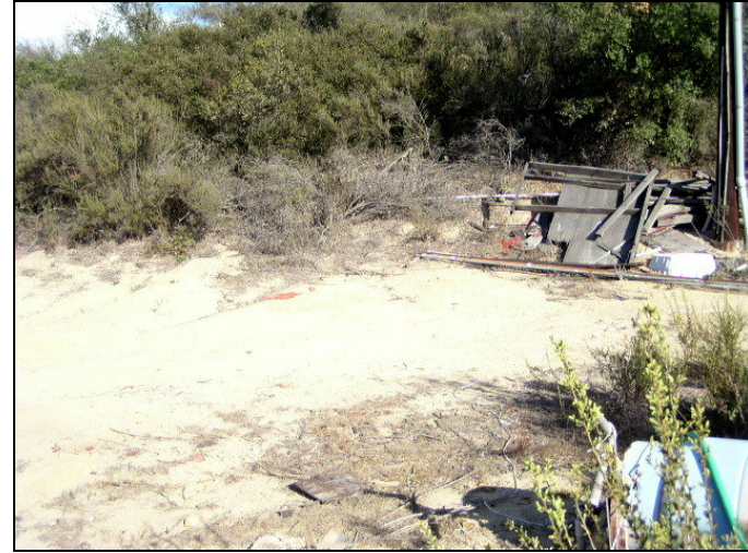
Photograph 2: View toward Margarita SDSU candidate location, facing southeast.