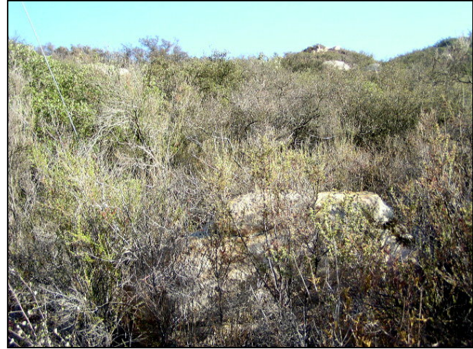
Photograph 6: View from Margarita SDSU candidate location, facing south.