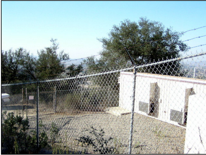
Photograph 5: View from Margarita SDSU candidate location, facing northeast.