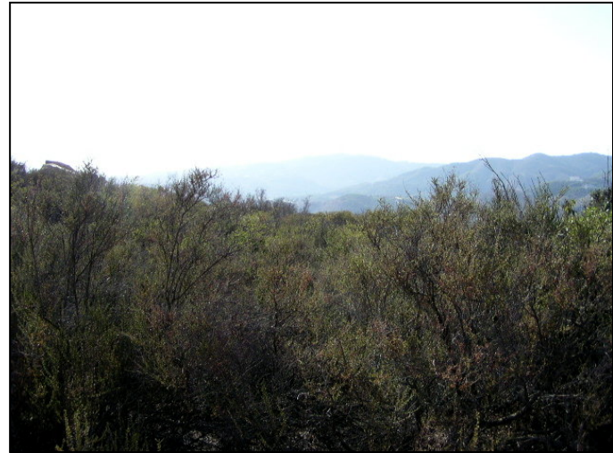
Photograph 8: View from Margarita SDSU candidate location, facing west.