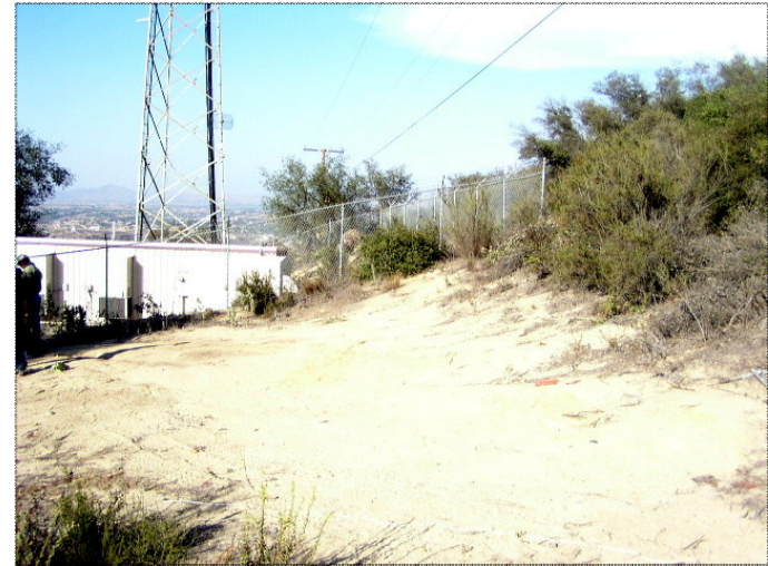
Photograph 4: View toward Margarita SDSU candidate location, facing east.