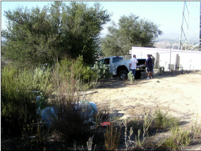
Photograph 3: View toward Margarita SDSU candidate location, facing northeast.